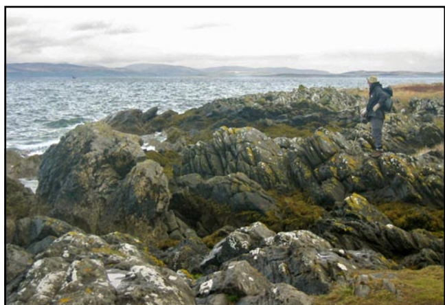
Figure 4. Hutton's angular unconformity at Lochranza, on Arran, with the Carboniferous cover dipping steeply left nearer the sea, over the Dalradian rocks dipping right where the person is standing.

Cairnsmuir they found granitoids cutting greywackes (now obscured). Further east, at Needles Eye on the Solway coast (Fig. 3), similar intrusions are seen, though they are less convincing than those at Glen Tilt. Indeed, Jameson, a Neptunist and one of Hutton's arch-critics, concluded that the evidence here was in favour of precipitation out of solution (Jameson, 1814; Brookfield, 1999).