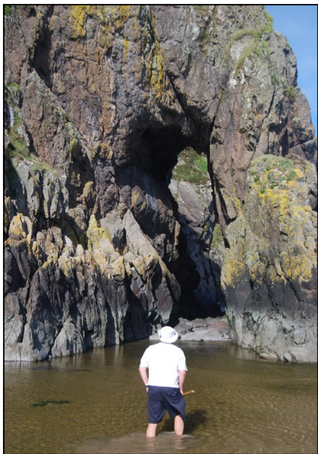
Figure 3. Silurian greywackes are intruded by red granodiorite from the Dalbeattie pluton, at Needles Eye, on the North Solway coast.

Cairnsmuir they found granitoids cutting greywackes (now obscured). Further east, at Needles Eye on the Solway coast (Fig. 3), similar intrusions are seen, though they are less convincing than those at Glen Tilt. Indeed, Jameson, a Neptunist and one of Hutton's arch-critics, concluded that the evidence here was in favour of precipitation out of solution (Jameson, 1814; Brookfield, 1999).