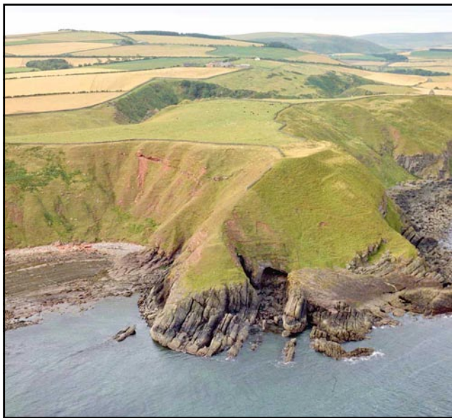
Figure 7. Siccar Point, with horizontal Old Red Sandstone overlying the nearly vertical Silurian greywackes.

Hutton published his Theory of the Earth (parts I & II) in 1795. It was not a success due to its prolixity and obscurity, and his opinions were challenged by Neptunists. But, with an explanatory text by Playfair (1802) and continued input from his supporters over the next 40 years, his views were gradually accepted. A further volume was published posthumously, edited by Geikie in 1899.