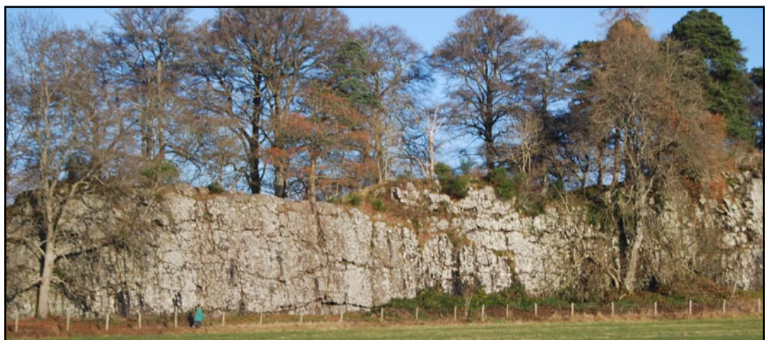
Figure 1. Dolerite dyke left as a wall after erosion of weaker country rocks, near Drummond Castle, Crieff; the rib of rock is about 300m long, 15m high and 10m thick

In 1786 he went with Clerk to Galloway “to see the junction of the granite country with the schistus strata of the south of Scotland” (Hutton, 1794) and at