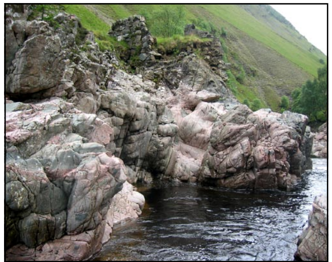
Figure 2. Veins of pink granite intrude metasedimentary rocks at Glen Tilt.

In 1785 he lectured the Royal Society of Edinburgh on a “System of the Earth”, concluding that the Earth operated as a “machine fired by heat”, and he promulgated the idea of uniformitarianism (Hutton,