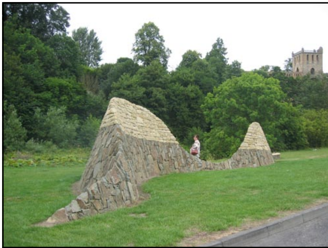
Figure 6. James Hutton's memorial wall at Jedburgh, with sandstone above and greywacke below.

partly washed away and partly remaining upon the ends of the vertical schistus; and in many places points of the schistus strata are seen standing up through among the sandstone”.